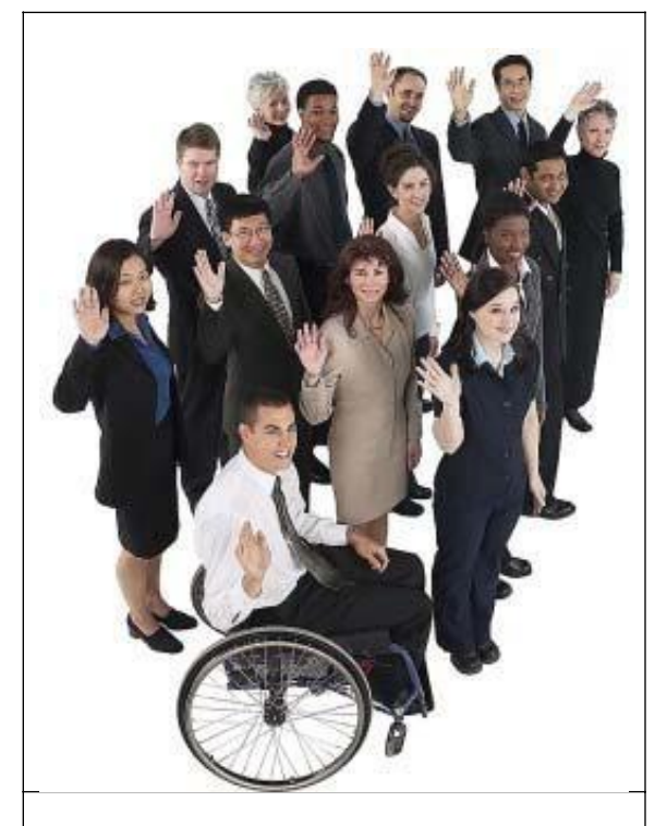
M.L.M. is available to everyone!

Direct sales, as we know it today, began back in the 1920s when larger manufacturers began to sell their products direct to their consumers, cutting out the middle-men and avoiding retail outlets altogether.